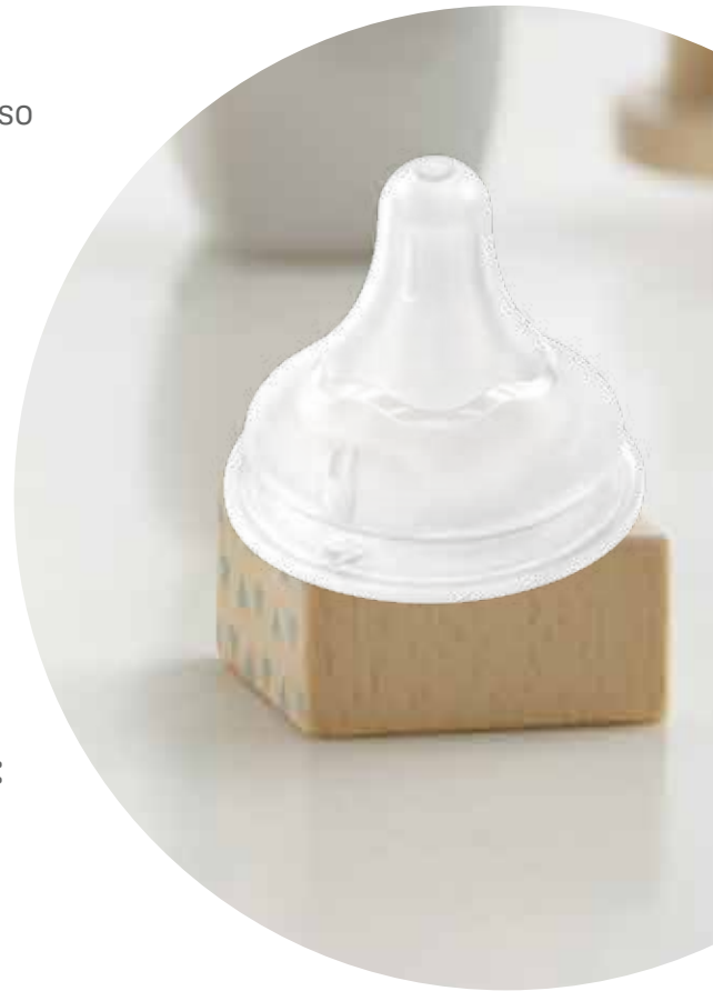
SofTouch™ Nipple Feeding Guideline Chart